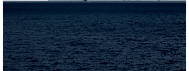
Photo: Approaching Antarctica from the sea.